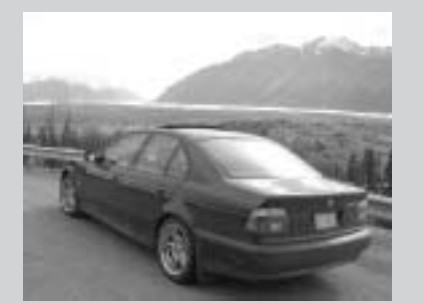
Cover: NCC Member Cliff Brody's 540i at the edge of Tagish Lake on the South Klondike Highway, Northwest B.C. See page 12 for a slightly different take on Cliff's adventure than what appeared previously in Roundel , this exclusive was written just for dB .