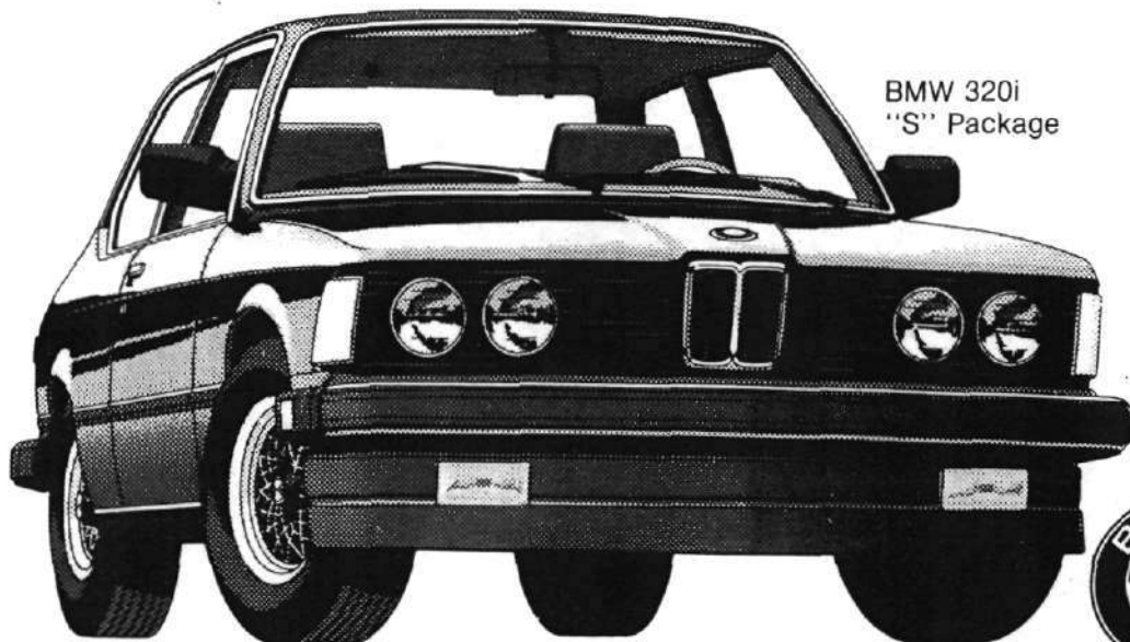
BMW 320i "S" Package

means more than power and handling at Heishman's. It means performance in sales, in service and especially, in professionalism