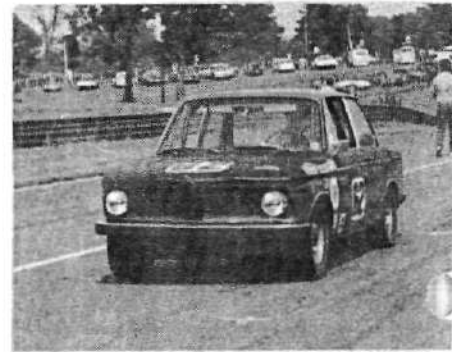
B.F.G. RADIAL SIX HOUR