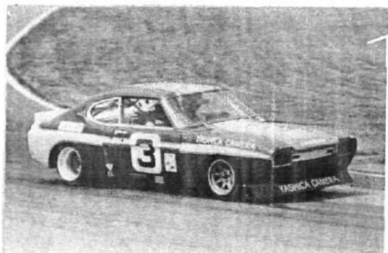
CAMEL GT SIX HOUR