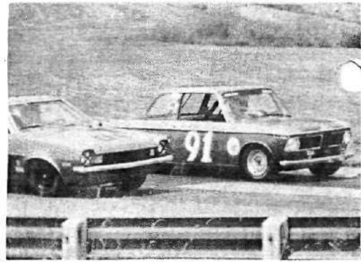
IMSA TWIN SIXES