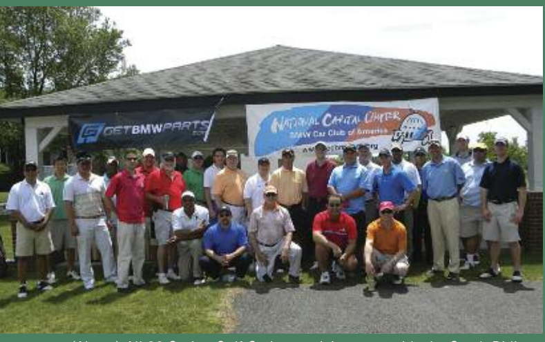
(Above) All 30 Spring Golf Outing participants outside the South Riding clubhouse.

The event itself is always a lot of fun. It's not about shooting a