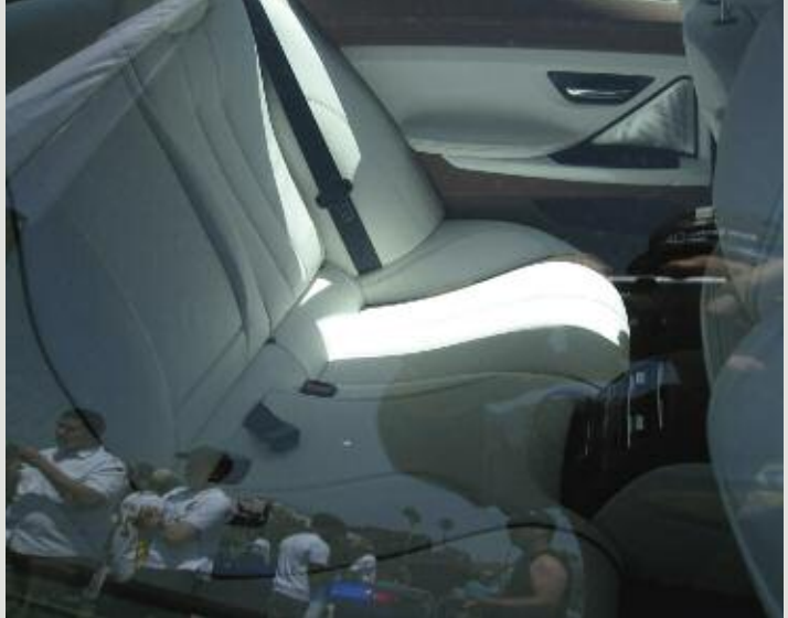
(Top and above) Unfortunately, the display vehicle was locked, but the driver and front passenger interior design seems exactly like the outstanding new 6 Series convertible. The rear seat interior design drew a lot of looks from the target market. In keeping with the outstanding driver/front passenger design, the Gran Coupe's rear seating area design will expand the appeal of the 6 Series. BMW finally has a strong competitor against the Porsche Panamerica and Mercedes SLK.

the outstanding interior of the current 6 Series. This is one of the few interiors where Audi could learn some lessons, especially in terms of color contrast and refinement. Based on what we saw (unfortunately, the displayed vehicle was locked), the Gran Coupe will be one of those vehicles parking valets will fight to drive.