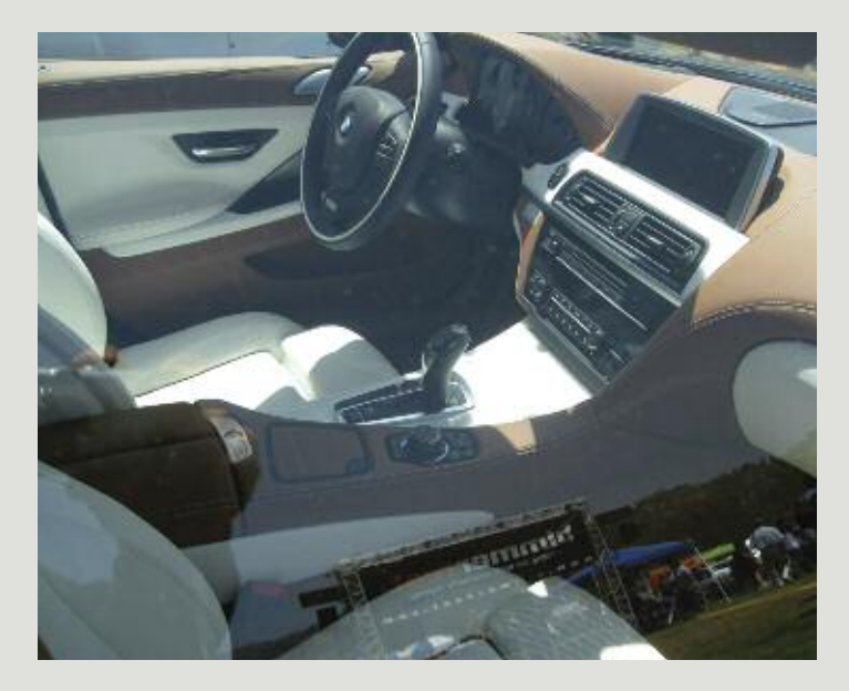
(Left) Even with a pseudo matte finish, the 2013 BMW 6 Series Gran Coupe attracted the target market at Bimmerfest West. Retailing for less than $75,000, the Gran Coupe is a strong competitor in this premium performance luxury sedan market.